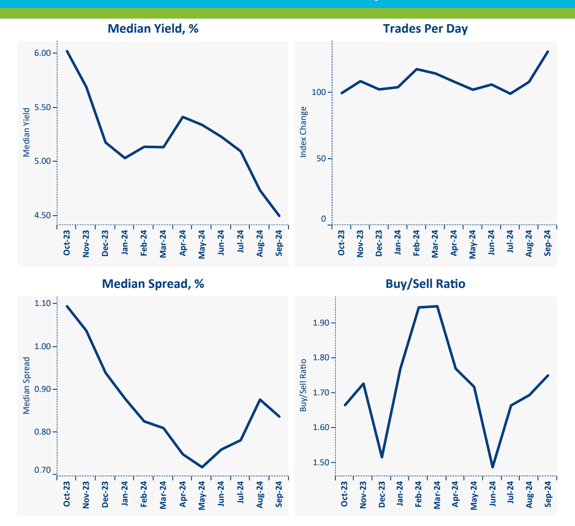
Daily Trades: First month = 100 Source: TRACE and Tradeweb Direct